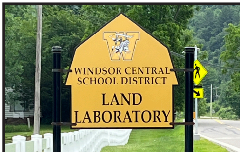
Windsor CSD wins Magna Grand Prize for agriculture program