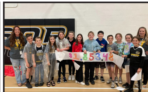
Bell's "Pennies for Patients" campaign raises $1,800+ for cancer research