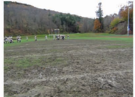
The existing High School athletic field requires an excessive amount of maintenance and has drainage issues.